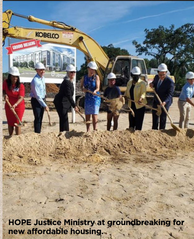
HOPE Justice Ministry at groundbreaking for new affordable housing.

To date, $46 million has been disbursed by the HOPE Affordable Housing Act to create 1,100 housing units.