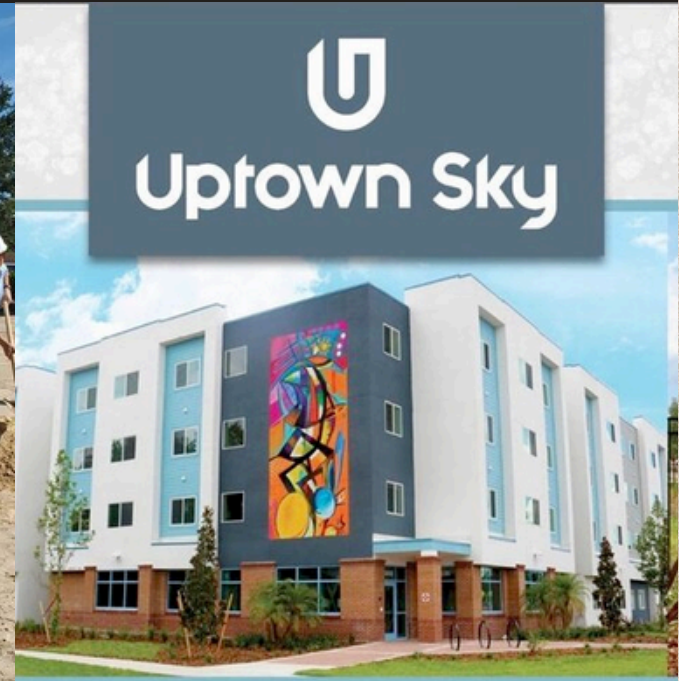
Blue Sky Communities & University Area CDC